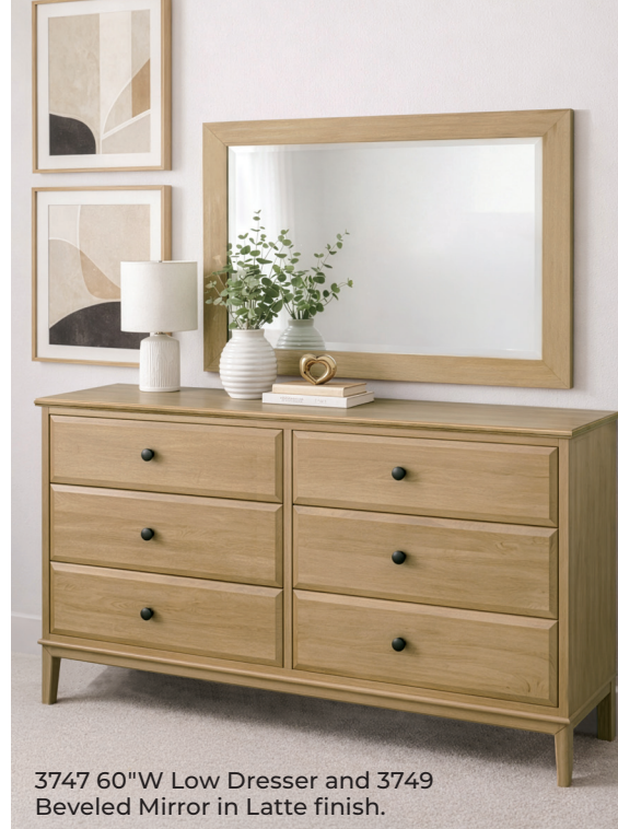
3747 60"W Low Dresser and 3749 Beveled Mirror in Latte finish.