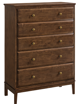
5-Drawer Chest #3738 40-1/2"W x 19-1/4"D x 55-3/4"H