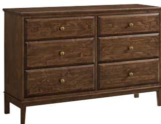
60"W Low Dresser #3747 60-1/2"W x 19-1/4"D x 39-3/4"H