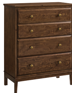
4-Drawer Chest #3735 37"W x 19-1/4"D x 47-3/4"H