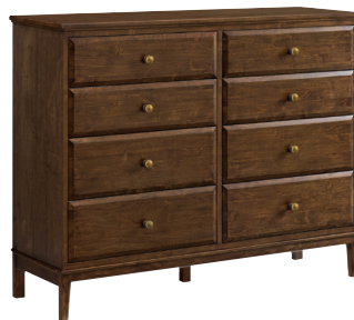
60"W Dresser #3748 60-1/2"W x 19-1/4"D x 47-3/4"H