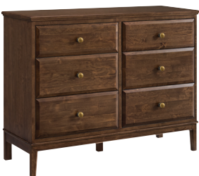
50"W Low Dresser #3745 50-1/2"W x 19-1/4"D x 39-3/4"H