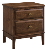
2-Drawer Nightstand #3733 23-1/2"W x 19-3/4"D x 26-3/4"H Features an attached dual port USB.