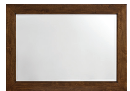
Beveled Mirror #3749 43-1/2"W x 3/4"D x 31-1/4"H

Mounts horizontally on dressers. Beveled glass. Mounts horizontally or vertically on the wall.