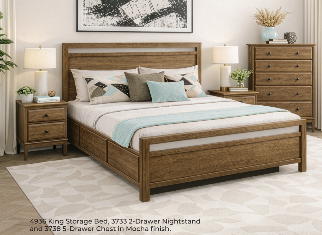
4936 King Storage Bed, 3733 2-Drawer Nightstand and 3738 5-Drawer Chest in Mocha finish.