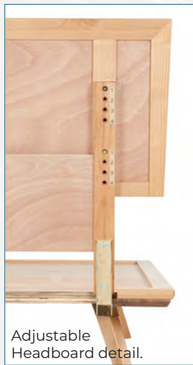
Adjustable Headboard detail.