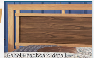
Panel Headboard detail.