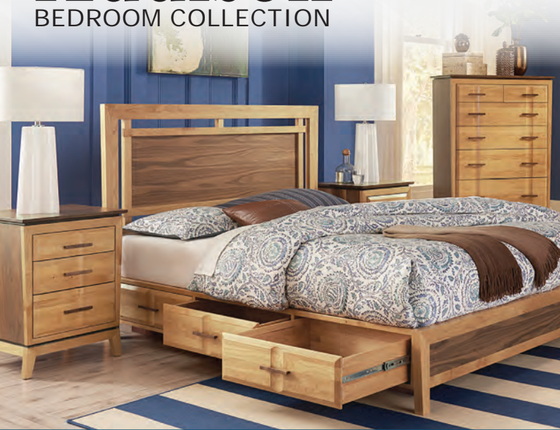
2018DUET Queen Panel Storage Bed, 1116DUET 3-Drawer Nightstand and 1143DUET 6-Drawer Chest.