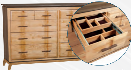
Jewelry tray detail.