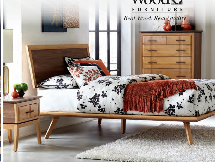
3800DUET Queen Adjustable Headboard Platform Bed, 1114DUET 1-Drawer Nightstand and 1143DUET 6-Drawer Chest.

This collection was inspired by mid-century styling yet has a dramatic flair all its own. The remarkable combination of American Alder and Black Walnut hardwoods is stunning. Complementing this beautiful blend are bold design choices that set this group apart. A precisely engineered 45-degree miter face frame