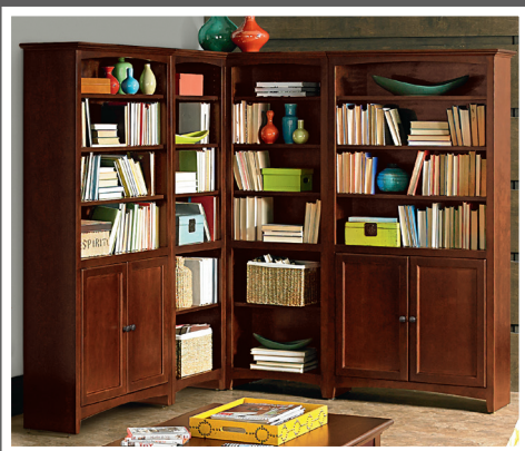
1545GAC 72"x36" Bookcases with Doors (FR & FL), 1524GAC 72"x24" Bookcases (FL/MR) & (FR/ML), 1509GAC Corner Connector in Glazed Antique Cherry finish.

Explore the various options. If you need assistance your Whittier Wood Furniture Retailer can help.