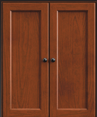
Glazed Antique Cherry • GAC Tuscan Bronze