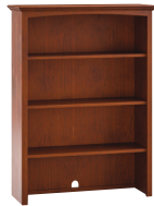
36\"W Hutch 38-1/4\"W x 51-1/8\"H