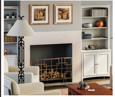
1625SN Cabinet (FR), 1626SN Hutch (FR), 1625SN Cabinet (FL), 1626SN Hutch (FL) Painted; Snowbound SW 7004.