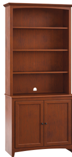
36\"W Cabinet & Hutch 38-1/2\"W x 84\"H