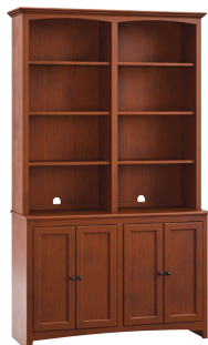
48\"W Cabinet & Hutch 50-5/8\"W x 84\"H