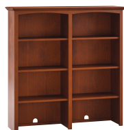
48\"W Hutch 50-11/16\"W x 51-1/8\"H