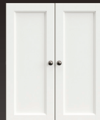
Snowbound • SN SW 7004 Antiqued Pewter