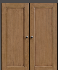
Pecan • PEC Antiqued Pewter