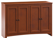
48\"W Cabinet 48-3/4\"W x 33-1/4\"H