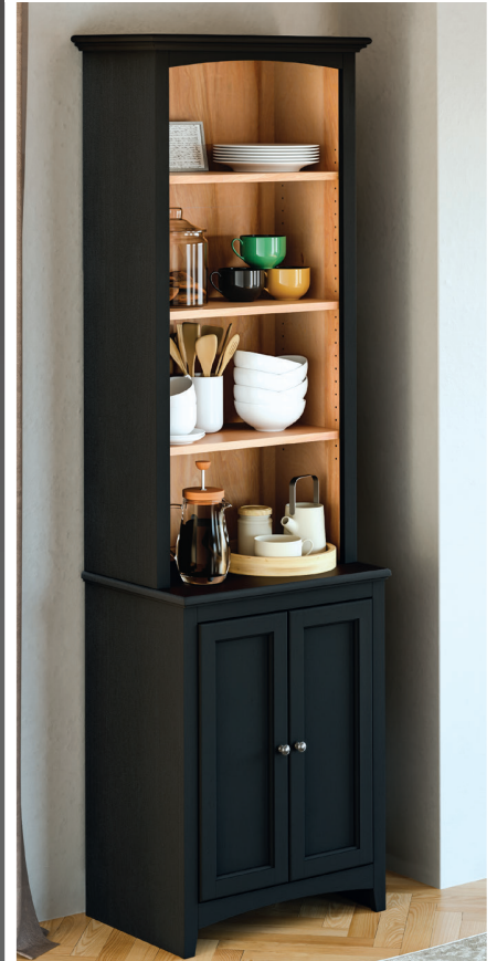
1613TBN Cabinet, 1614TBN Hutch in Tricorn Black SW 6258 and Natural Alder Two-Tone finish.