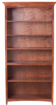
Center Wall Unit

39-1/2"W x 18-1/2"D x 76-1/2"H 4 Adjustable Shelves: 34-1/4"W x 15-1/4"D