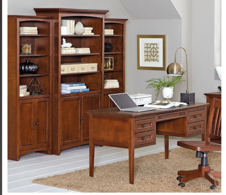
1611GAC Center Wall Unit with Doors, 1525GAC 72\"x24\" Bookcases with Doors (FR/FL) in Glazed Antique Cherry finish.