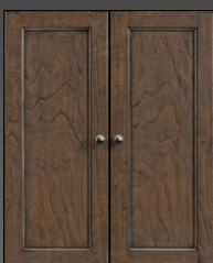
Java • JAV Antiqued Pewter