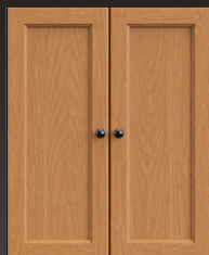
Natural Alder • NA Tuscan Bronze