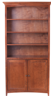
Center Wall Unit with Doors

39-1/2"W x 18-1/2"D x 76-1/2"H 4 Adjustable Shelves: 34-1/4"W x 15-1/4"D