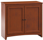
36\"W Cabinet 36-3/4\"W x 33-1/4\"H