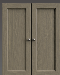
Fieldstone • FST Antiqued Pewter