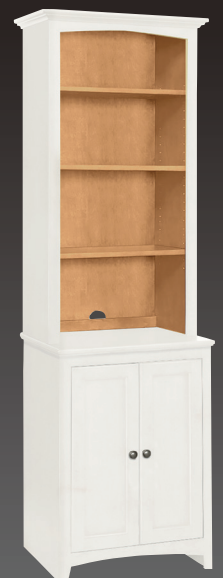
Two-tone: Select Sherwin-Williams® paint and Natural Alder finish.