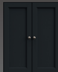
Tricorn Black • TB SW 6258 Antiqued Pewter