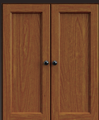
Hazelnut • HAZ Tuscan Bronze