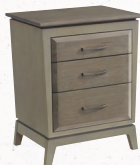
· 3-Drawer Nightstand #2116AST 23-1/4"W x 17-1/2"D x 29"H Features Dual Port USB Charger.