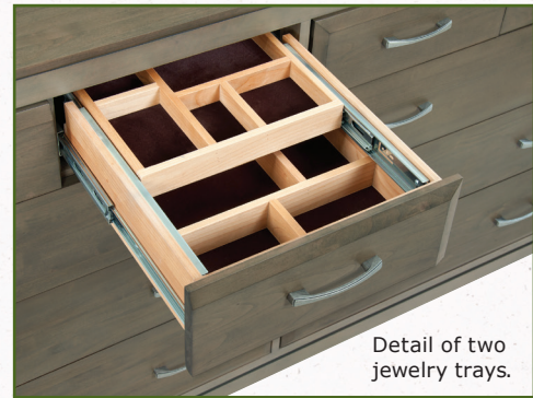
Detail of two jewelry trays.