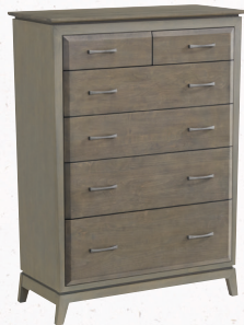
· 6-Drawer Chest #2143AST 39-3/4"W x 18"D x 54"H