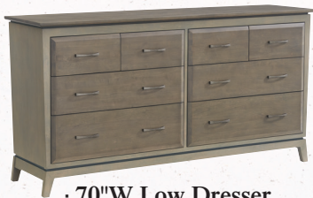
· 70"W Low Dresser #2138AST 70"W x 18"D x 36"H