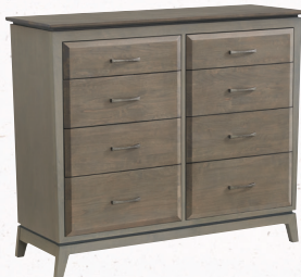
· 50"W Dresser #2136AST 50"W x 18"D x 42"H