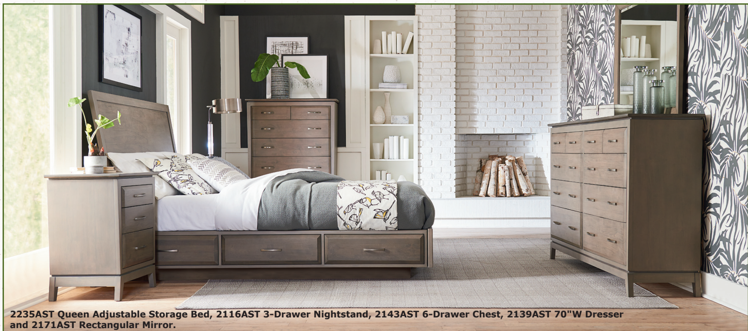
2235AST Queen Adjustable Storage Bed, 2116AST 3-Drawer Nightstand, 2143AST 6-Drawer Chest, 2139AST 70"W Dresser and 2171AST Rectangular Mirror.

We strive to provide an accurate representation of our finishes. Variations due to lighting and printing limitations may occur. To determine the actual color of a finish, please visit your local Whittier Wood Furniture retailer. Product availability and specifications shown are based on the latest product information available at the time of printing and are subject to change without notice.