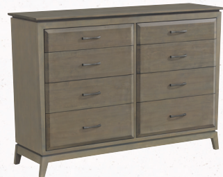
· 60"W Dresser #2137AST 60"W x 18"D x 42"H