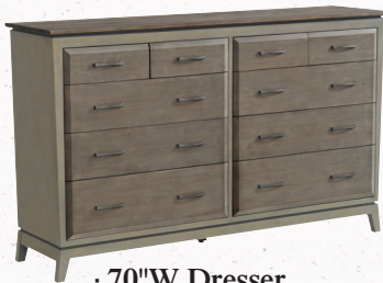
· 70"W Dresser #2139AST 70"W x 18"D x 42"H · Features one drawer with two velvet lined jewelry trays.