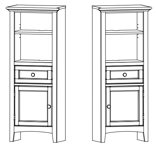
Thank you for allowing us to help you furnish your home. We are certain you will be delighted with your new furniture for many years to come.

GAC = Glazed Antique Cherry finish JAV = Java finish FST = Fieldstone finish PEC = Pecan finish Assembly Instructions