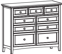
1127AUFa 9-Drawer McKenzie Dresser