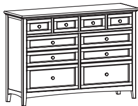
1128AUFa 10-Drawer McKenzie Dresser