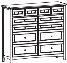
1182AUF 12-Drawer McKenzie Dresser