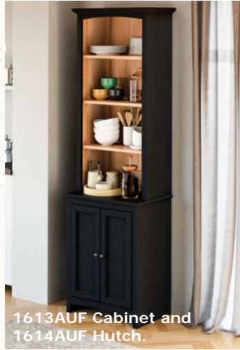
1613AUF Cabinet and 1614AUF Hutch.