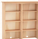
1632AUF • Hutch 50-11/16"W x 51-1/8"H