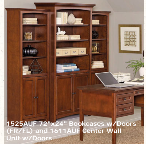
1525AUF 72"x24" Bookcases w/Doors (FR/FL) and 1611AUF Center Wall Unit w/Doors.

4 Adjustable Shelves: 34-1/4"W x 15-1/4"D