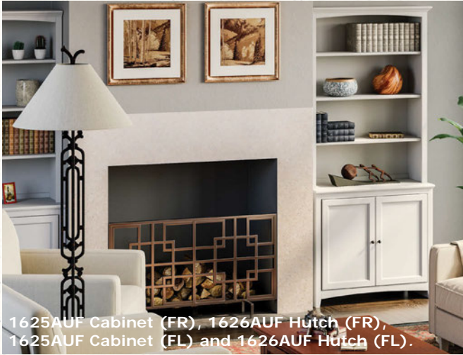
1625AUF Cabinet (FR), 1626AUF Hutch (FR), 1625AUF Cabinet (FL) and 1626AUF Hutch (FL).

Unit depths: Cabinet 16-7/8"D & Hutch 13-3/8"D