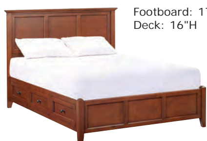
Footboard: 17-3/4"H Deck: 16"H