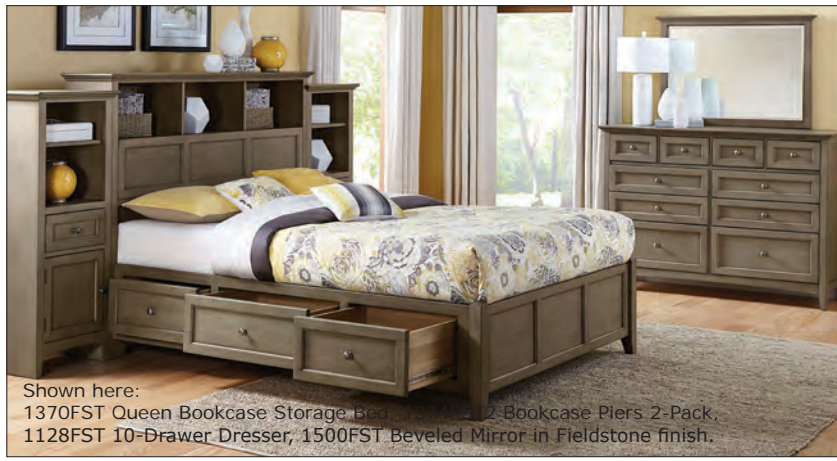
Shown here: 1370FST Queen Bookcase Storage Bed, 1372 Bookcase Piers 2-Pack, 1128FST 10-Drawer Dresser, 1500FST Beveled Mirror in Fieldstone finish.