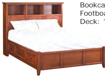
Bookcase Storage Beds: Footboard: 19-1/2"H Deck: 17-3/4"H