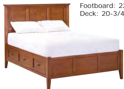
Footboard: 22-1/2"H Deck: 20-3/4"H

All storage bed sizes have six spacious drawers equipped with maximum access, full extension metal ball bearing drawer slides.