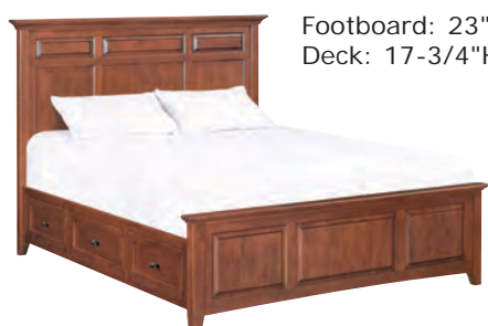
Footboard: 23"H Deck: 17-3/4"H