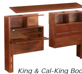
King & Cal-King Bookcase Headboard split design.