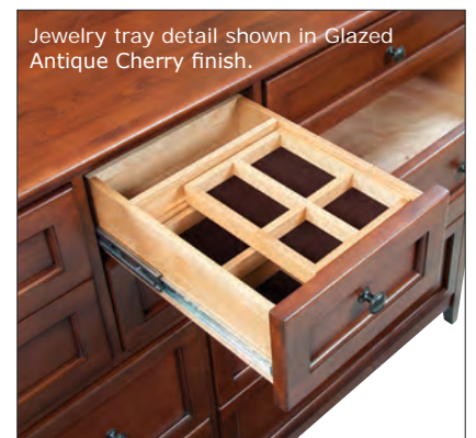
Jewelry tray detail shown in Glazed Antique Cherry finish.