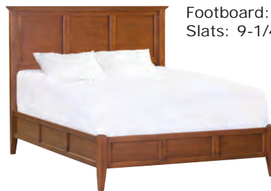
Footboard: 17-1/2"H Slats: 9-1/4"H