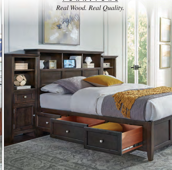
Shown here: 1370CAF Queen Bookcase Storage Bed and 1374CAF2 Bookcase Piers 2-Pack in Caffè finish.

Distinctive design and elegant details make for a striking combination in this stylish bedroom collection. Made from certified sustainable American Alder and Alder veneered hardwoods, this line includes heritage-quality craftsmanship details such as English dovetail drawers, mortise and tenon joinery and fitted backs. Whisper-quiet full extension metal ball bearing drawer slides provide maximum access to spacious drawers. We're sure you will appreciate how these and other standard features enhance your family's daily lives. We look forward to helping you create your well-furnished and well-loved home.