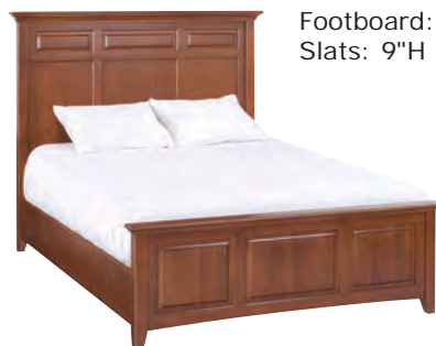
Footboard: 23"H Slats: 9"H