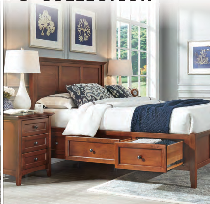
Shown here: 1316GAC Queen Storage Bed and 1101GAC 3-Drawer Nightstand shown in Glazed Antique Cherry finish.