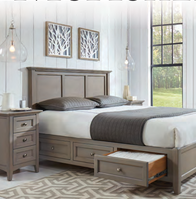
Shown here: 2376FST Queen Petite Storage Bed and 1100FST Small 3-Drawer Nightstand shown in Fieldstone finish.

Whittier Wood FURNITURE Real Wood. Real Quality.