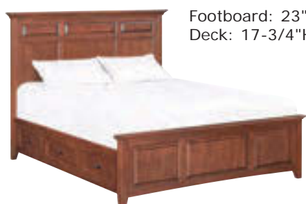
Footboard: 23"H Deck: 17-3/4"H