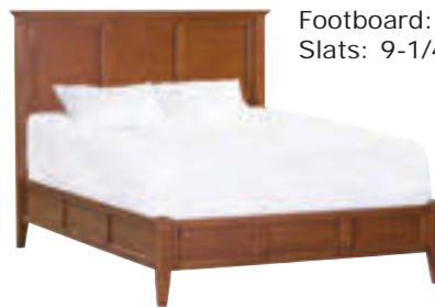
Footboard: 17-1/2"H Slats: 9-1/4"H