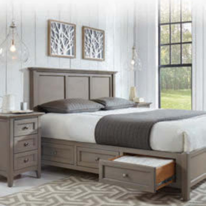
Shown here: 2376FST Queen Petite Storage Bed and 1100FST Small 3-Drawer Nightstand shown in Fieldstone finish.

Whittier Wood FURNITURE Real Wood. Real Quality.