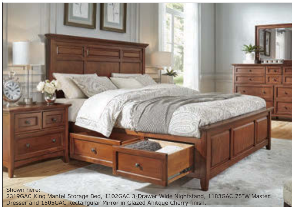
Shown here: 2319GAC King Mantel Storage Bed, 1102GAC 3-Drawer Wide Nightstand, 1183GAC 75"W Master Dresser and 1505GAC Rectangular Mirror in Glazed Anitque Cherry finish.