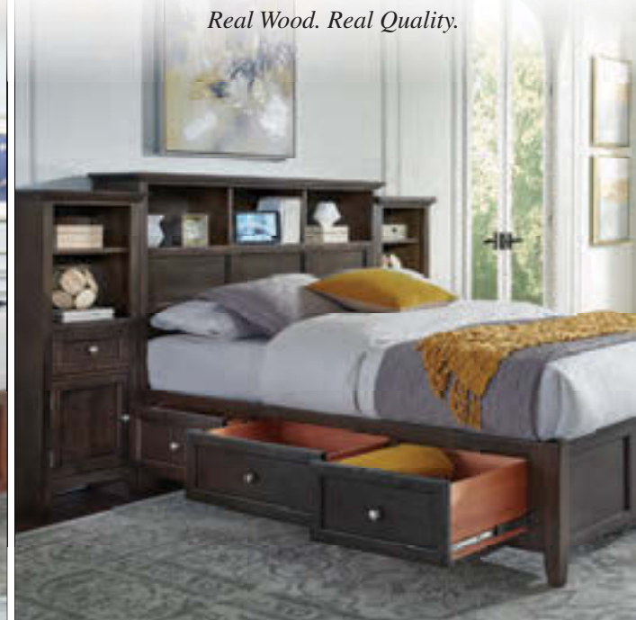
Shown here: 1370CAF Queen Bookcase Storage Bed and 1374CAF2 Bookcase Piers 2-Pack in Caffè finish.

Distinctive design and elegant details make for a striking combination in this stylish bedroom collection. Made from certified sustainable American Alder and Alder veneered hardwoods, this line includes heritage-quality craftsmanship details such as English dovetail drawers, mortise and tenon joinery and fitted backs. Whisper-quiet full extension metal ball bearing drawer slides provide maximum access to spacious drawers. We're sure you will appreciate how these and other standard features enhance your family's daily lives. We look forward to helping you create your well-furnished and well-loved home.