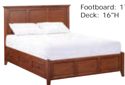
Footboard: 17-3/4"H Deck: 16"H