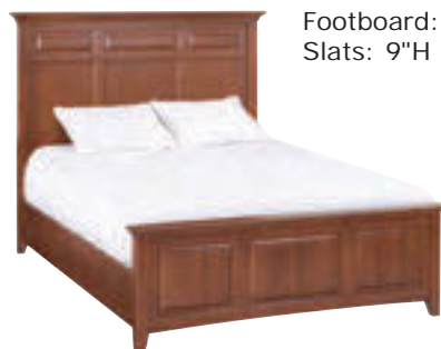
Footboard: 23"H Slats: 9"H