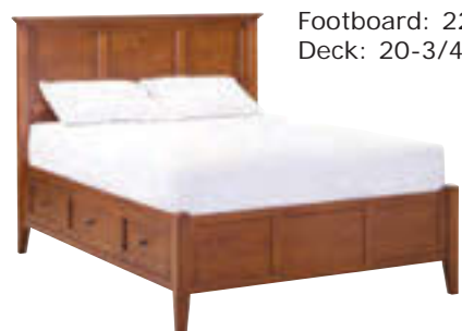
Footboard: 22-1/2"H Deck: 20-3/4"H

All storage bed sizes have six spacious drawers equipped with maximum access, full extension metal ball bearing drawer slides.