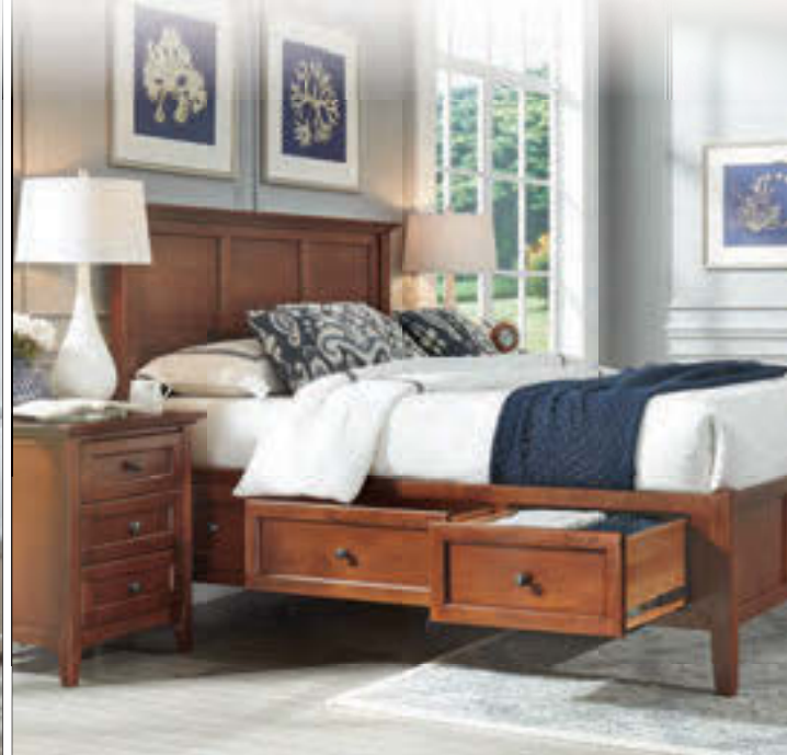
Shown here: 1316GAC Queen Storage Bed and 1101GAC 3-Drawer Nightstand shown in Glazed Antique Cherry finish.